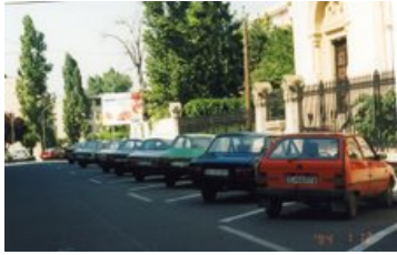
Long gone are the days where the Dacia is the only car Romanians can purchase