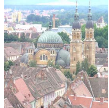
Downtown Timisoara, a city in southern Romania

If interested, please send your CV and letter of interest to info@equality-romania.org