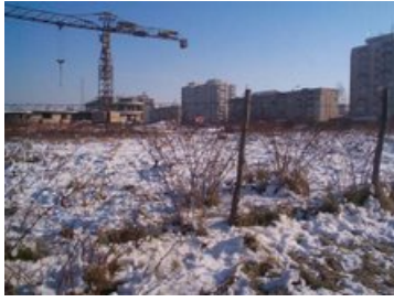
Baia Mare, an industrial city in northern Romania