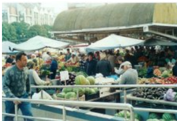
Supermarkets are springing up, but most Romanians still do their shopping at the outdoor public market.